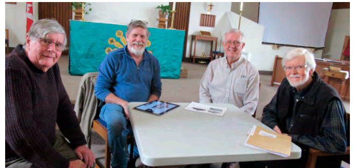
The AV Team meets to plan upgrades to our Sanctuary