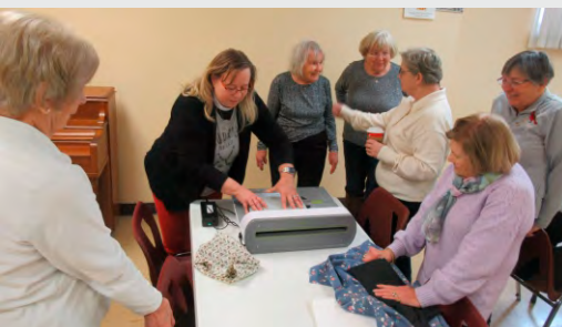
Mind Your Fingers! - Prayer Quilts