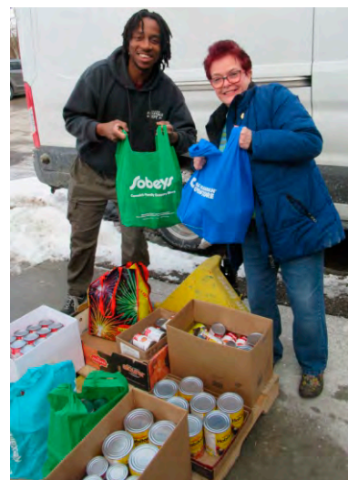
200 cans of Soup to the Guelph Street Food Bank