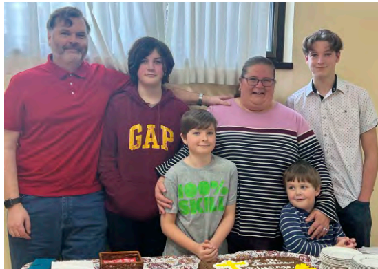
Farewell to the Butlers