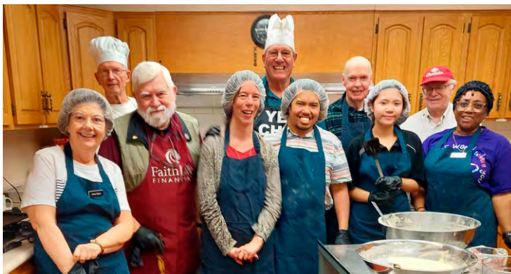
The Yes Chef and the Sous Chef Team