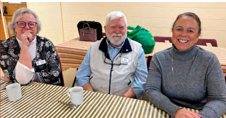
Coffee Hour Smiles