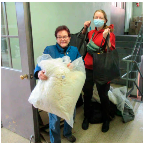
St John's Outreach-Walk a Mile in My Shoes