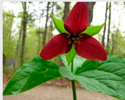
Ontario Trillium – Canisbay Lake Canoe Trip

[Philippians 1:21] May the Sunday of the Resurrection [Easter Sunday] have a special message for you this year; one that is new and bold and wonderful and refreshing and exciting.