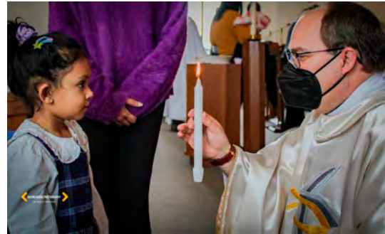
Taya, Receive the Light of Christ