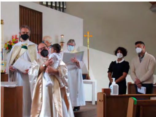
Blessings of Baptism