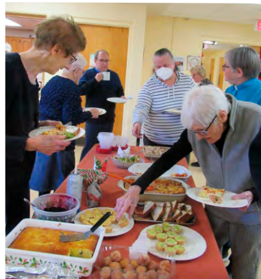
Monthly Seniors Brunch