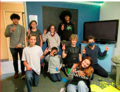
Junior Youth Group