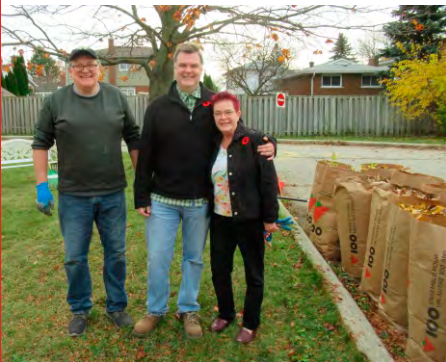
Willing Hands Make Light Work