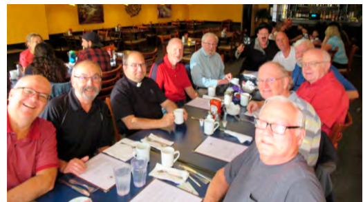
Men's Fall Breakfast

THE NEWSLETTER OF THE PEOPLE OF ST. GEORGE'S OF FOREST HILL ANGLICAN CHURCH