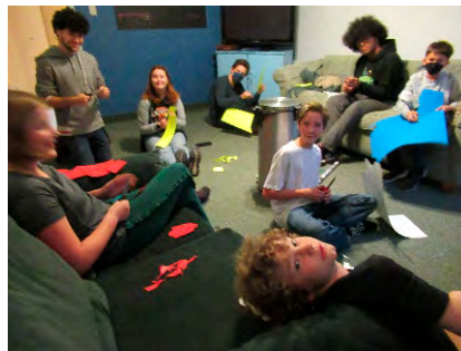
Youth Cut Out Angels for Christmas Outreach