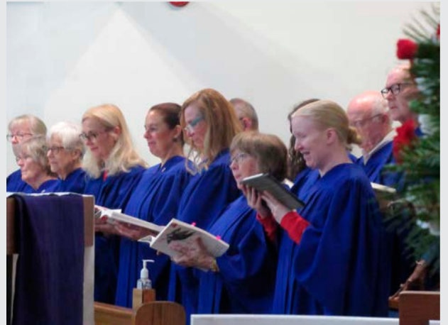
Our New Choir Gowns!!