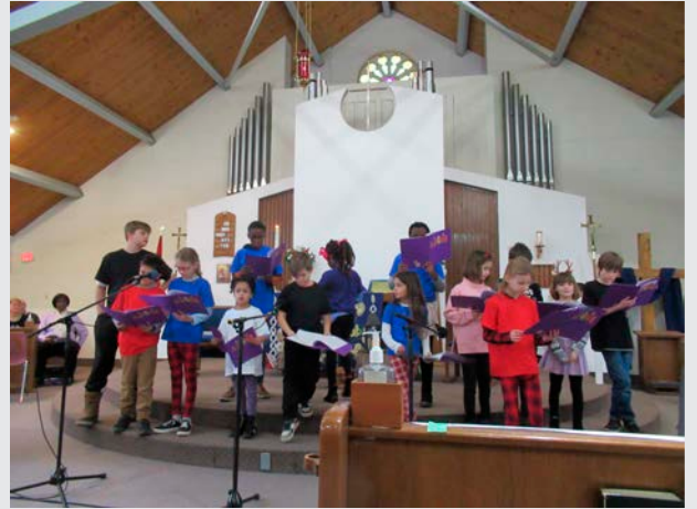
Away in a Manager- Children's Pageant 2023