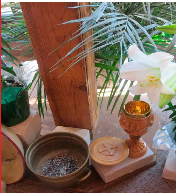
Good Friday Nails in Jardinière at foot of the cross

stgeorgesofforesthill.com/easter-services