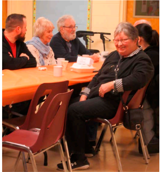
Pioneers in Our Pancake Supper