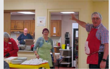
Pancake Supper for Our Foster Children