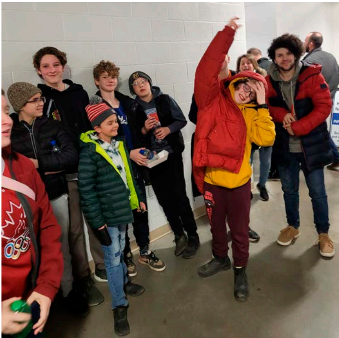
Holy Dragons at a Rangers Hockey Game