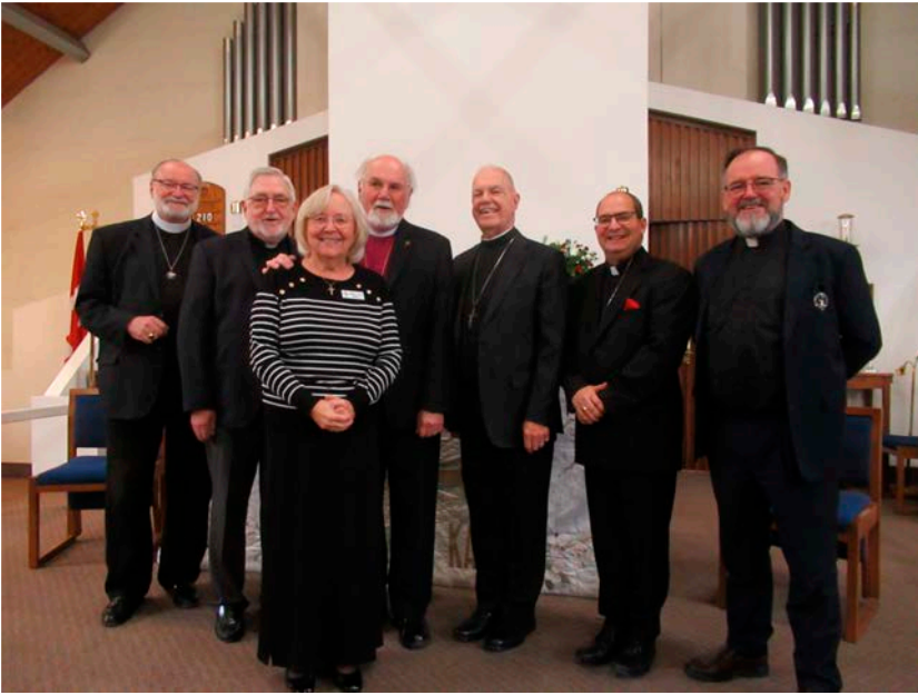
5 Priests, One Deacon and One Warden