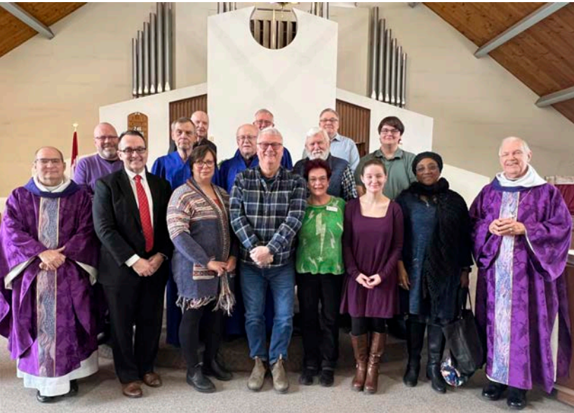
Induction of 2024 Parish Council