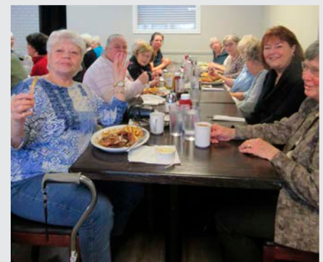
Ladies' Feb Luncheon