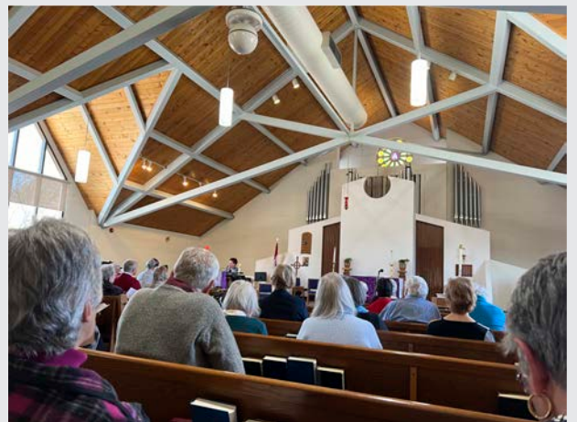
World Day of Prayer