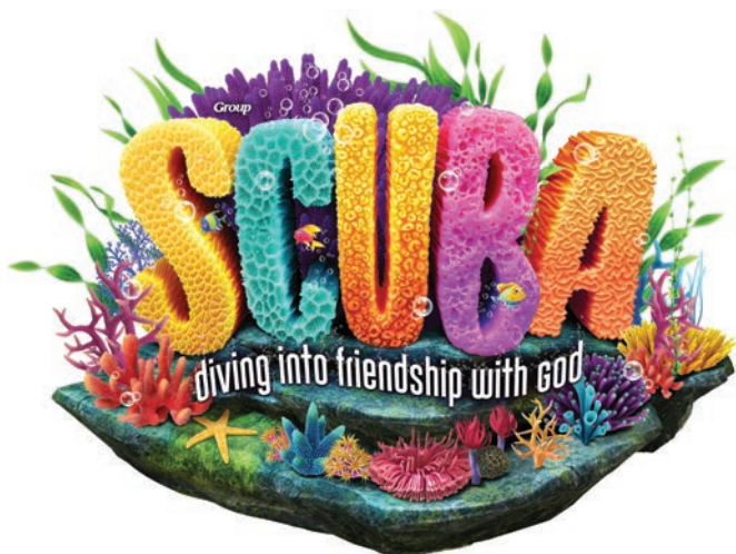
VBS: Aug. 12-16