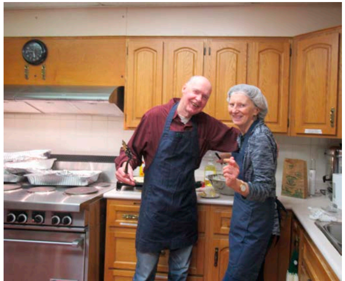
What a Team!