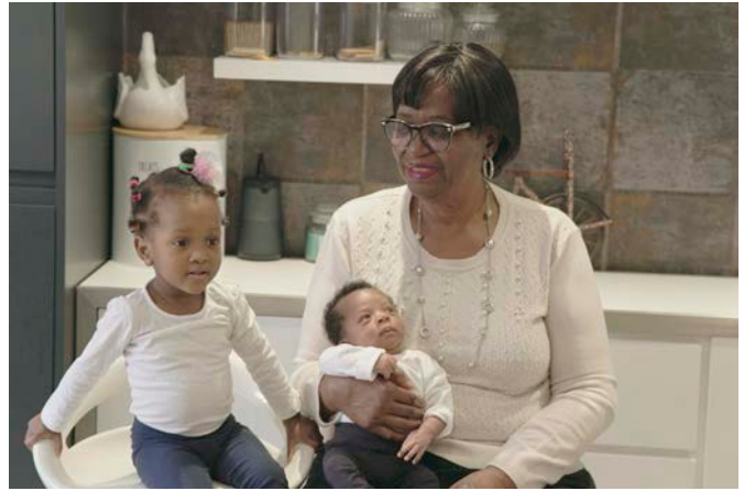
Funke & G-Kids