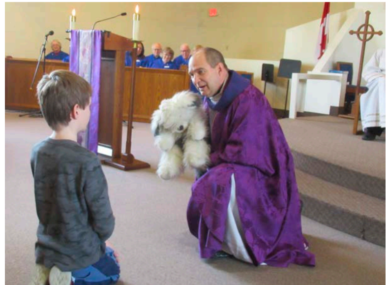
Chelsea, the dog, leads Children's Focus